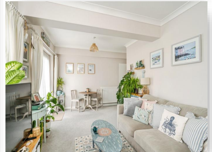
Bayview Court Nyewood Lane, Bognor Regis PO21 2QG