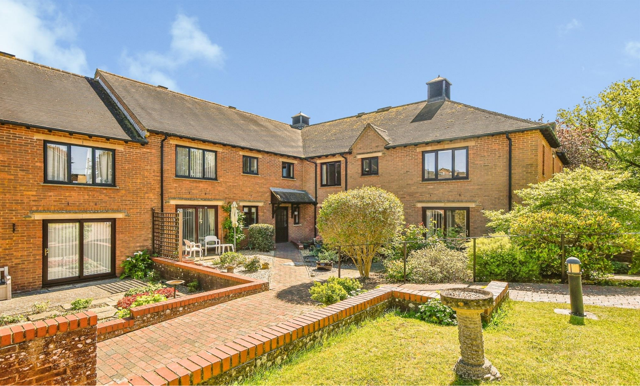
Parsonage Court, Highworth Swindon SN6 7TJ