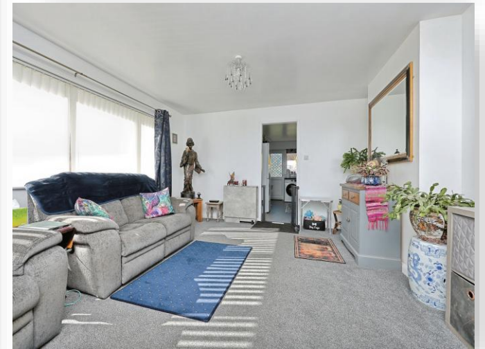
Couhe Close, Swaffham, PE37 7JS