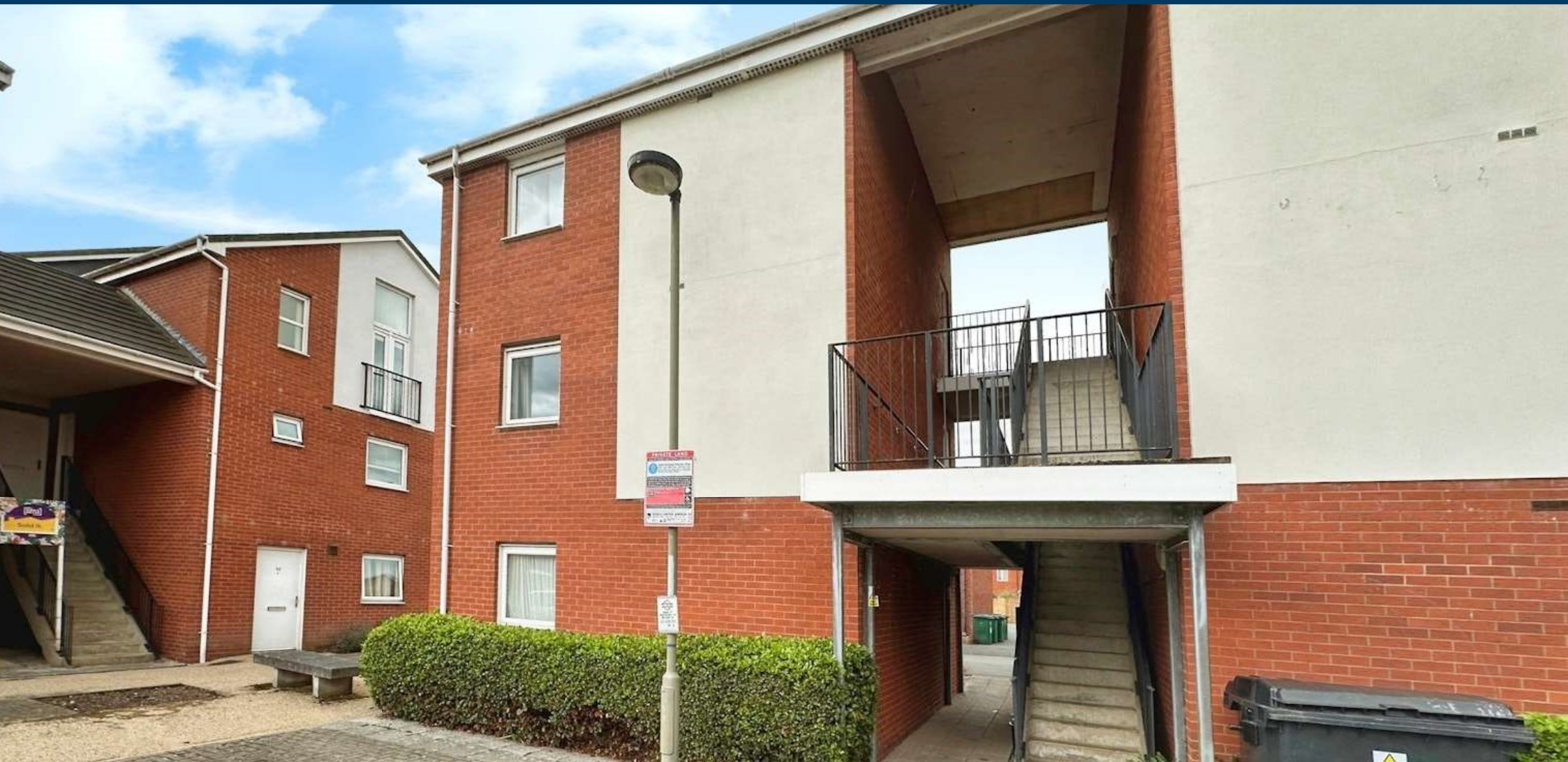
Wildhay Brook, Hilton, Derby