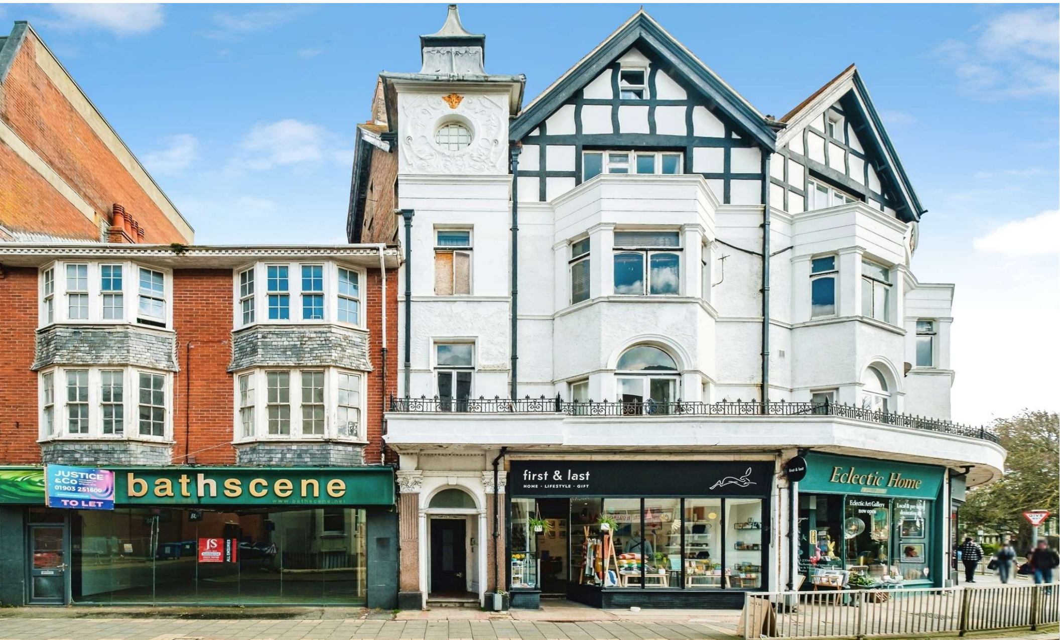
Warwick Mansions Brighton Road, Worthing BN11 3EL