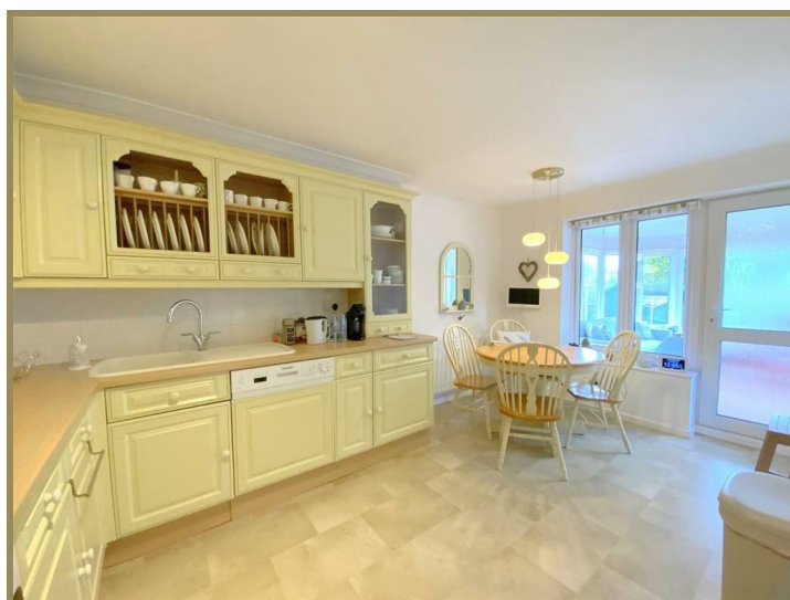
19 Billingham Court, Cleethorpes, DN35 0JU £350,000