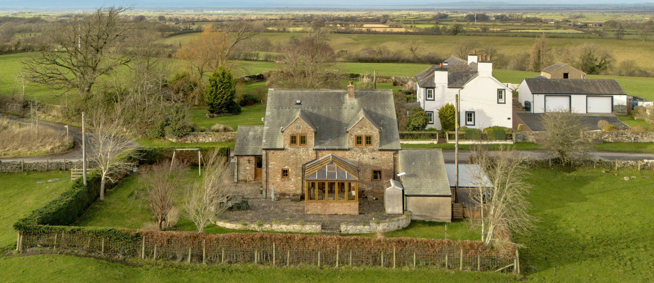
Powcroft Cottage , Wigton, CA7 8NH