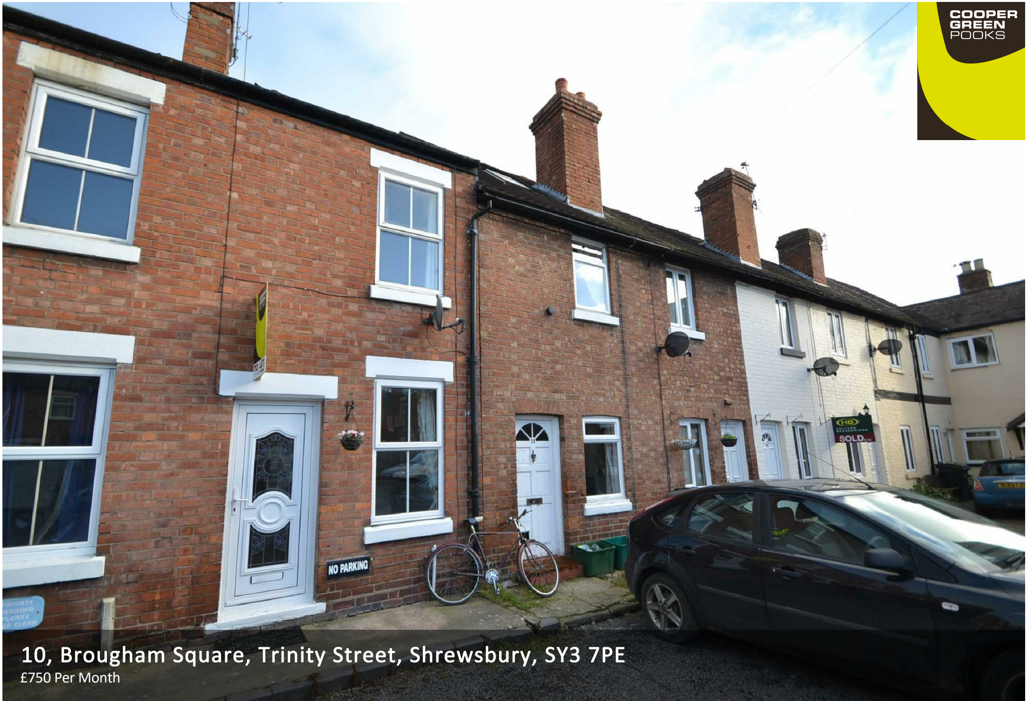
10, Brougham Square, Trinity Street, Shrewsbury, SY3 7PE £750 Per Month