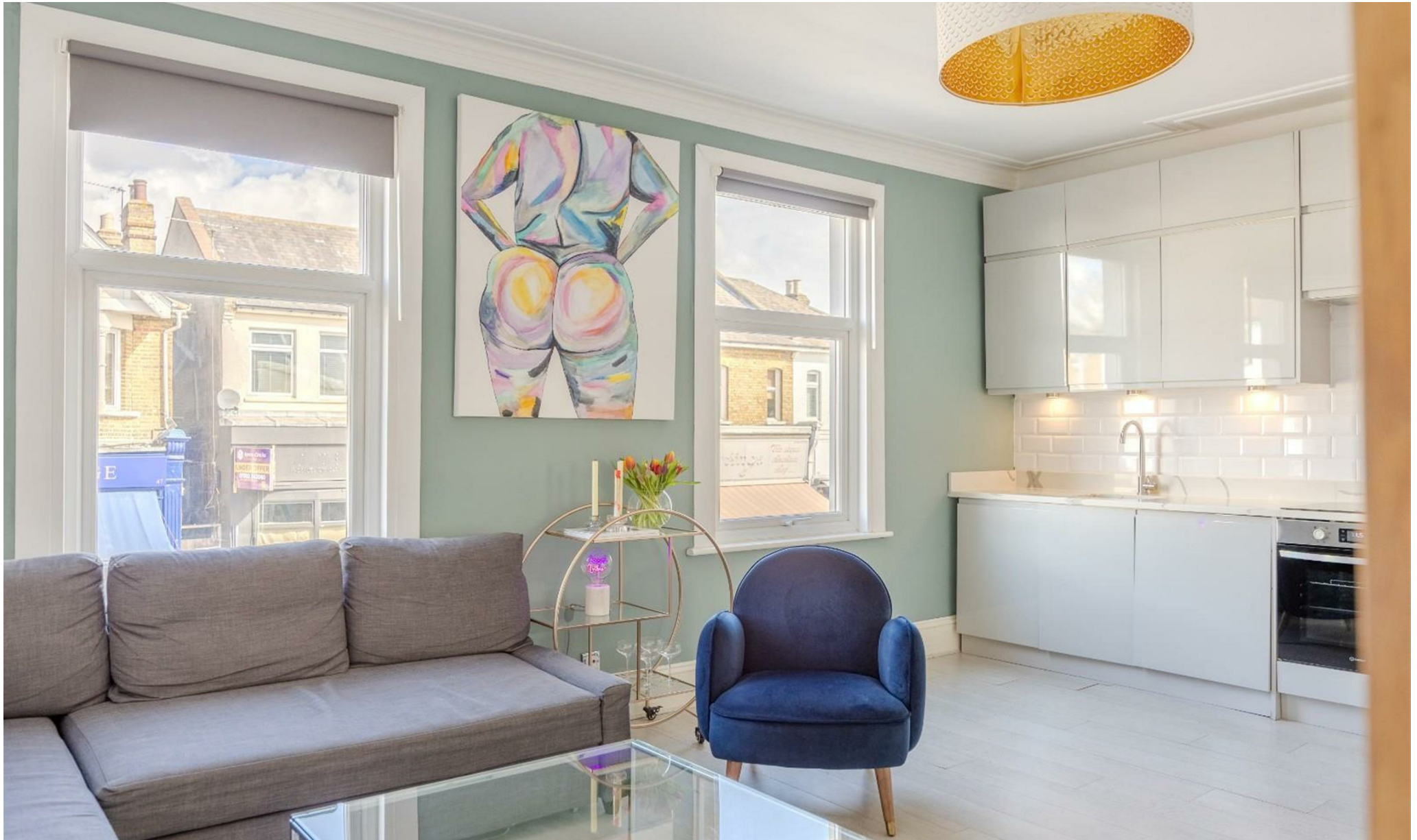
Broadway, Leigh-On-Sea £325,000