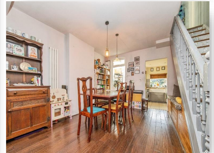
Greenstead Road, COLCHESTER, CO1 2SP