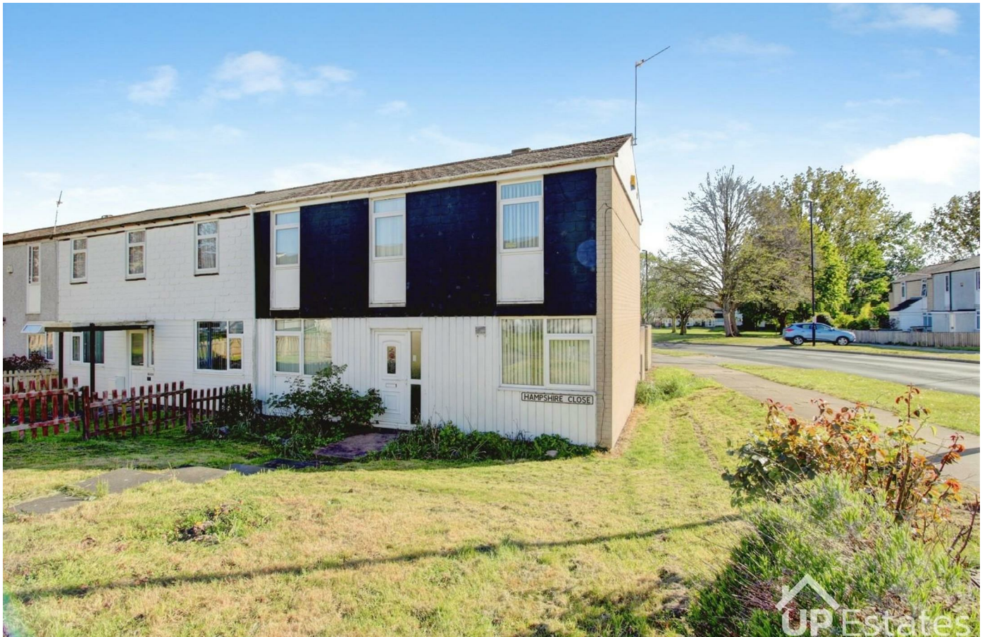
Hampshire Close, Binley, Coventry