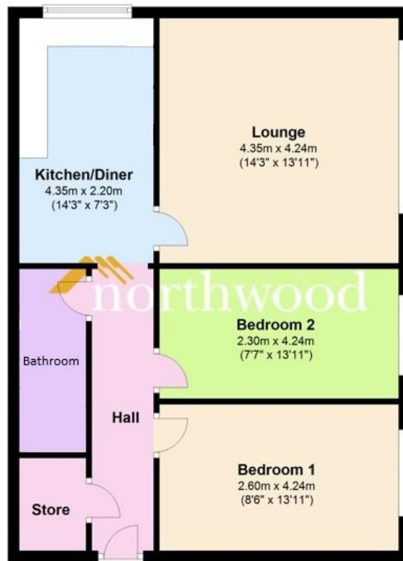
This floor plan is for illustrative purposes only. Plan produced using PlanUp.