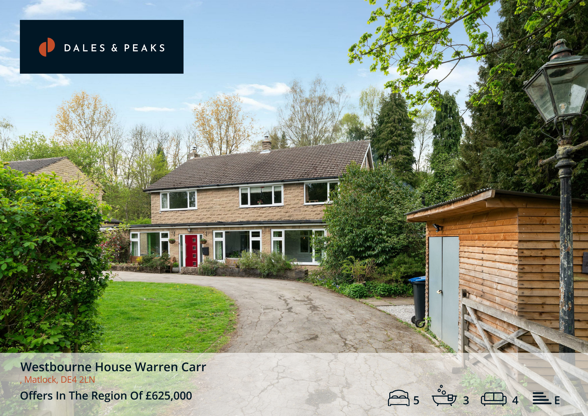
Westbourne House Warren Carr Matlock, DE4 2LN Offers In The Region Of £625,000