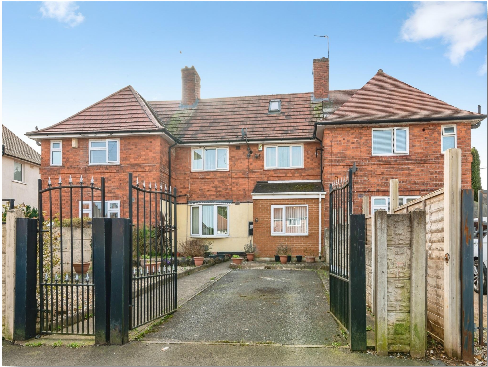
Rosslyn Drive, Nottingham NG8 5PU