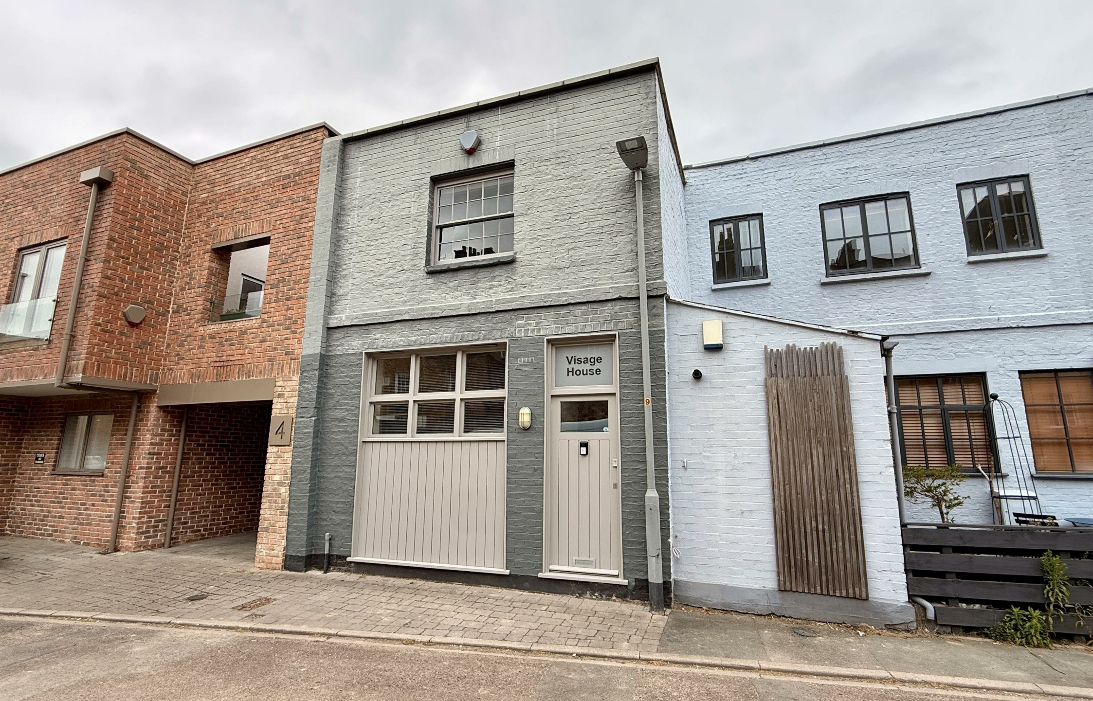
VISAGE HOUSE LANSDOWN PLACE LANE, CHELTENHAM, GL50 2LB