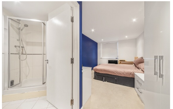
Bowling Green Place, SE1