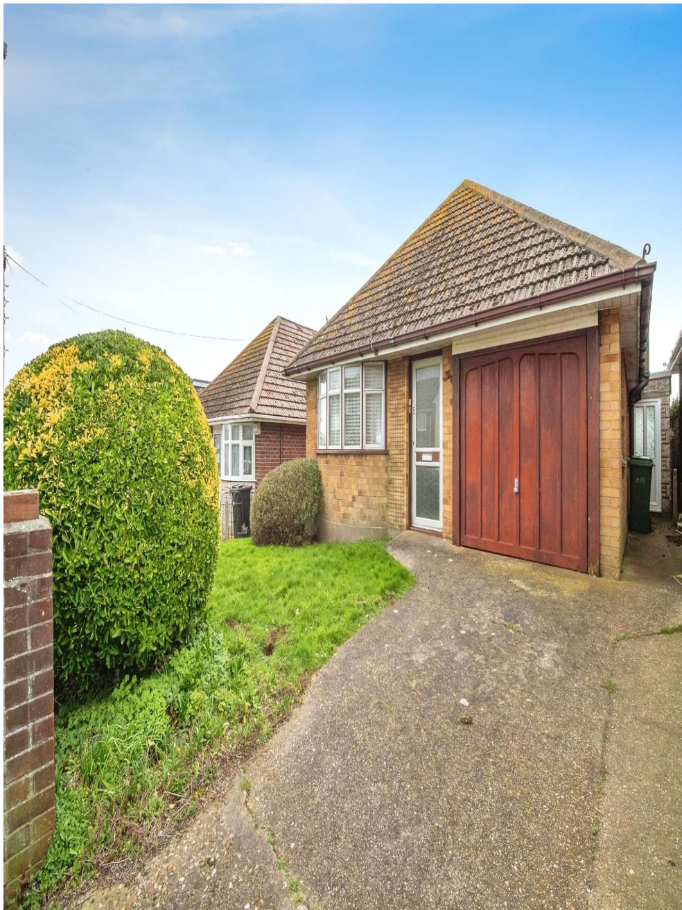
Westhill Road, Weymouth DT4 9NE