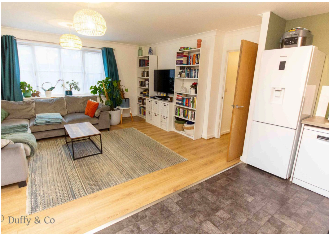
Duffy & Co