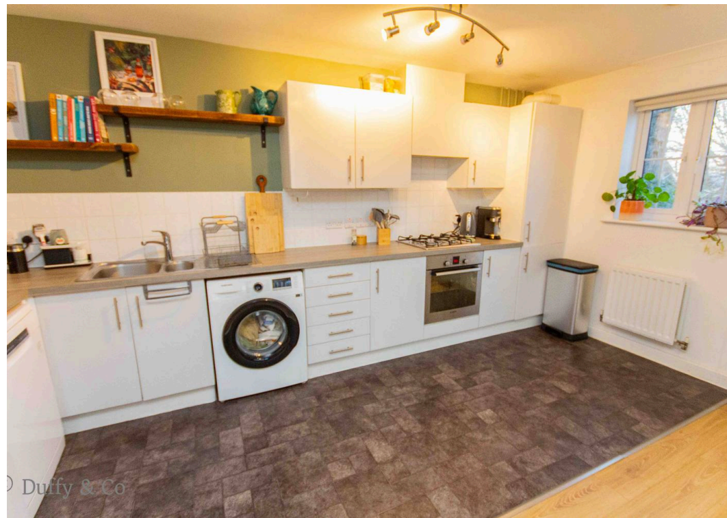
Duffy & Co