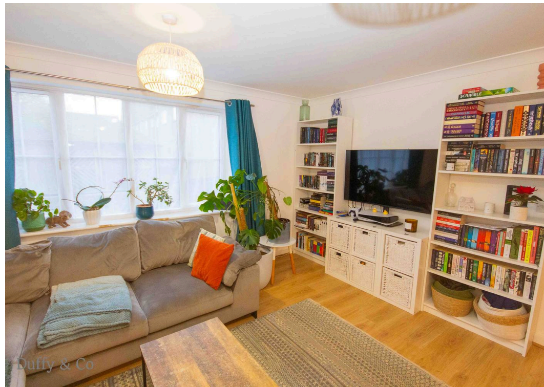
Duffy & Co