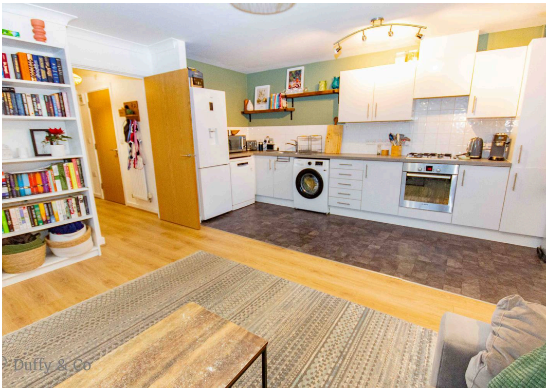
Duffy & Co