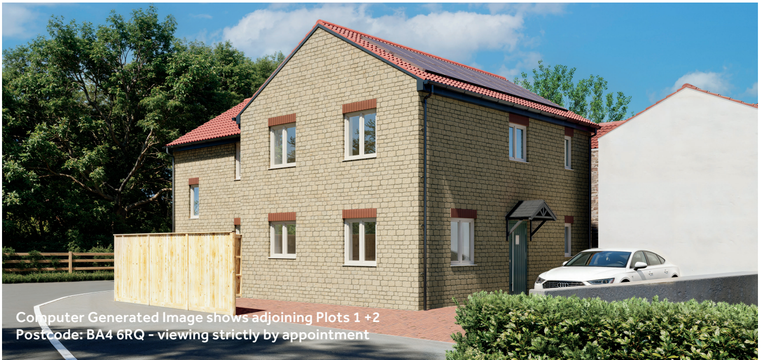
Computer Generated Image shows adjoining Plots 1 +2 Postcode: BA4 6RQ - viewing strictly by appointment

Set at the foot of the much-admired Wraxall Vineyard, Barrel Cottage (Plot 2), sits within this bespoke collection of seven new homes perfectly positioned to enjoy far-reaching views across South Somerset.