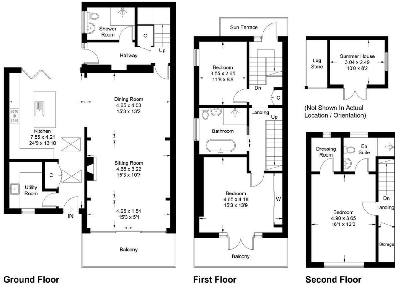
Illustration for identification purposes only, measurements are approximate, not to scale. Fourlabs.co © (ID1290466)

Total Floor Area = 175.3 sq m / 1887 sq ft