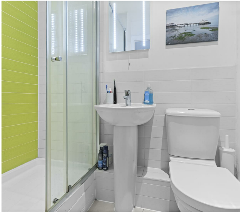
Reid Crescent, Hailsham