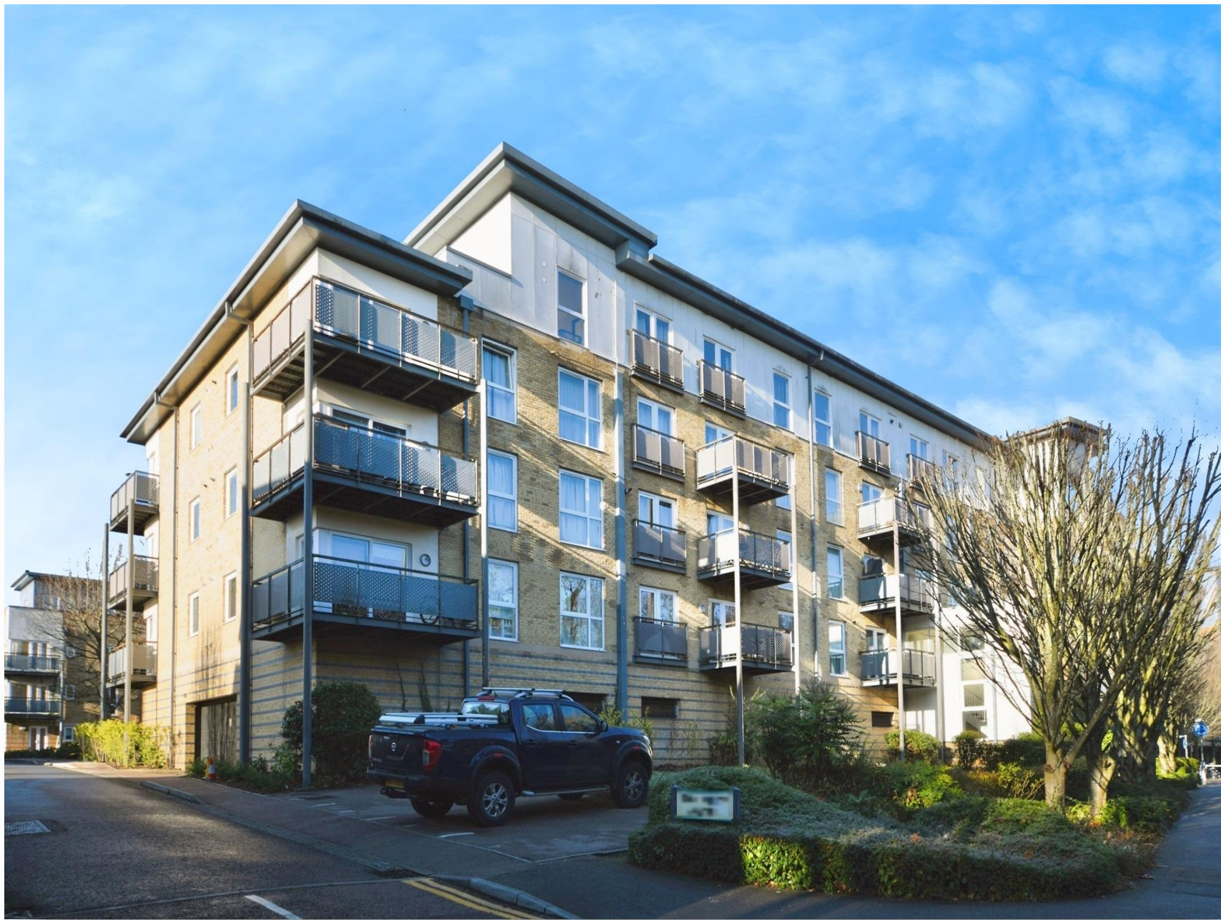
Westmount Apartments, Metropolitan Station Approach, Watford, WD18 7BE