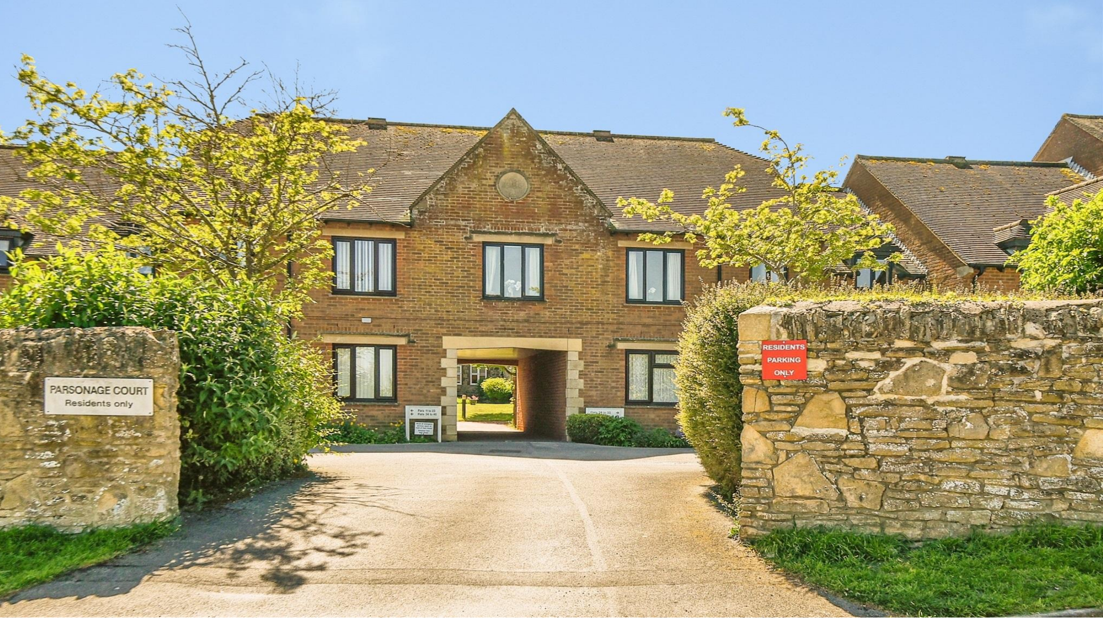
Parsonage Court, Highworth Swindon SN6 7TJ