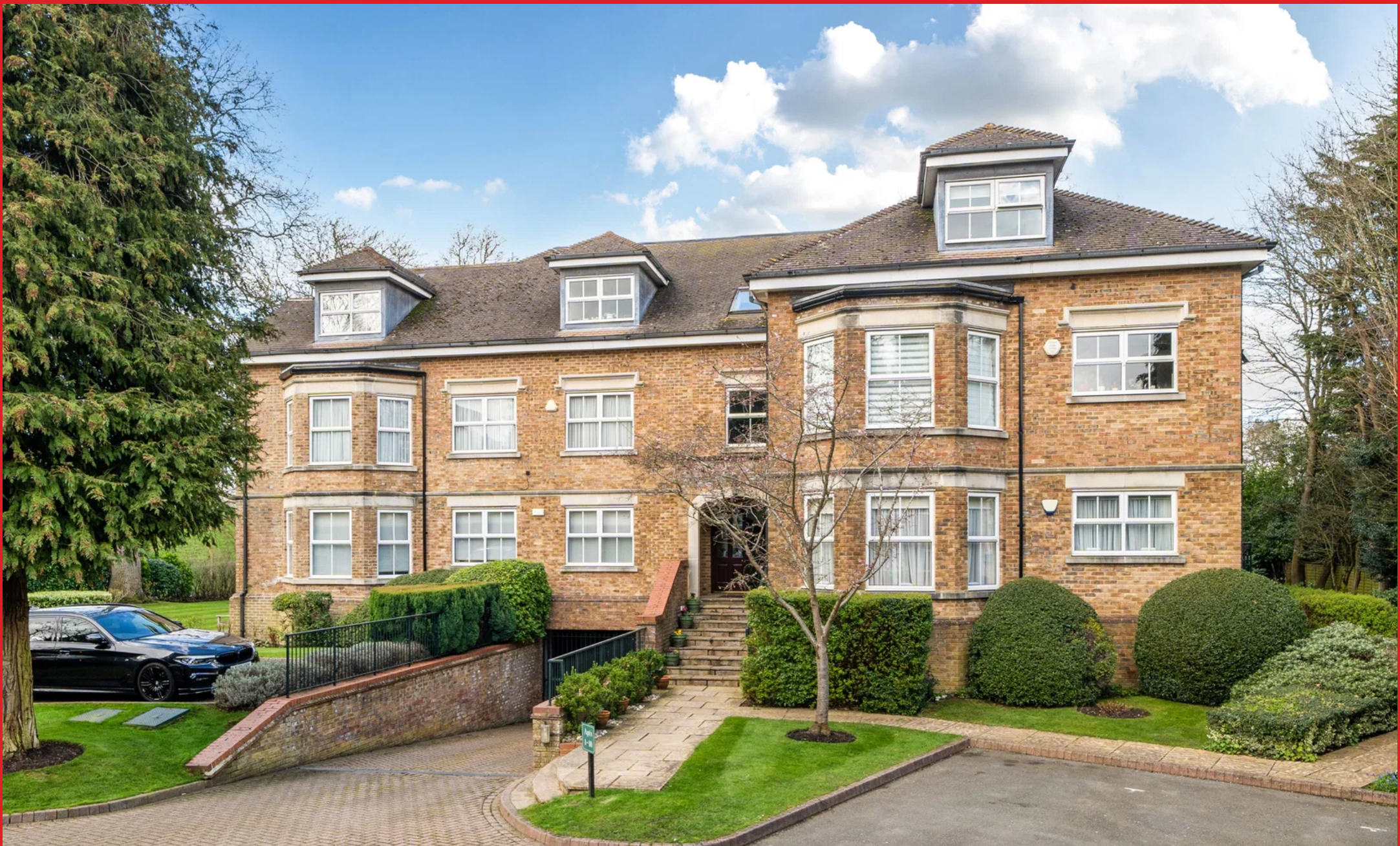
The Laurels, Magpie Hall Road, Bushey Heath, WD23 Bushey