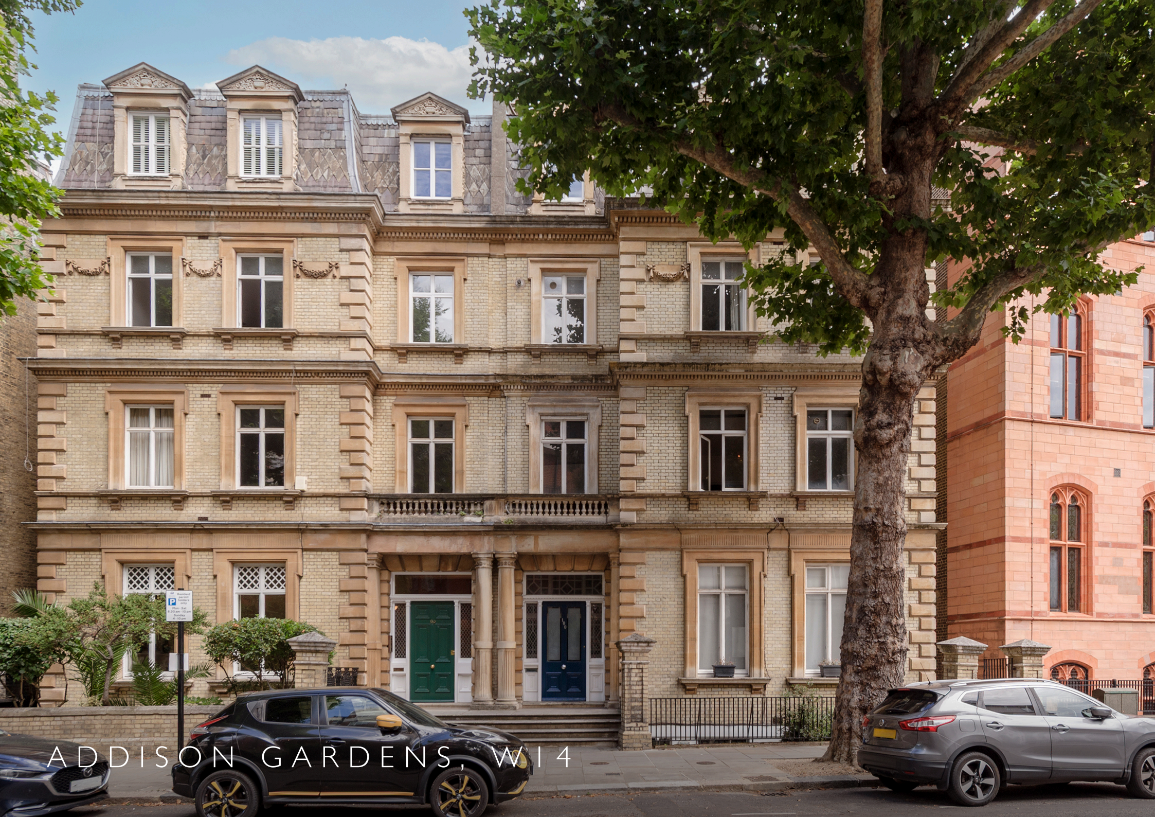
ADDISON GARDENS, W14