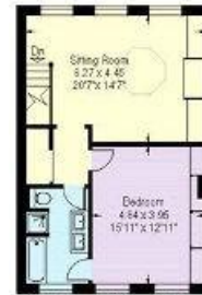
First Floor (Mews)