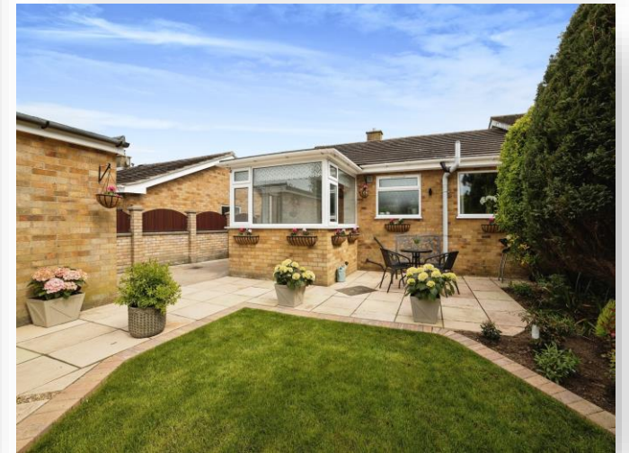
Bracken Avenue, Overstrand Cromer NR27 0NZ