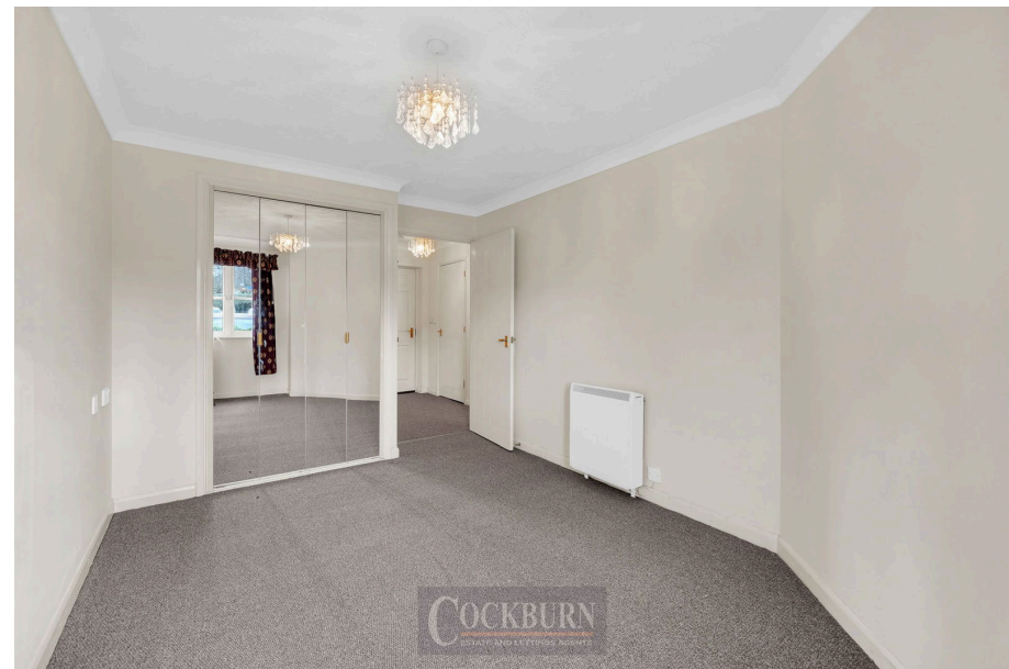
Paxton Court SE12 Approximate Gross Internal Area = 475 sq ft / 44.1 sq m

Cockburn are excited to present to the market this one bedroom, ground floor retirement flat, available to those aged 60 years +. The property consists of large reception/dining room with direct access into the communal garden, kitchen, well proportioned bedroom and bathroom suite.