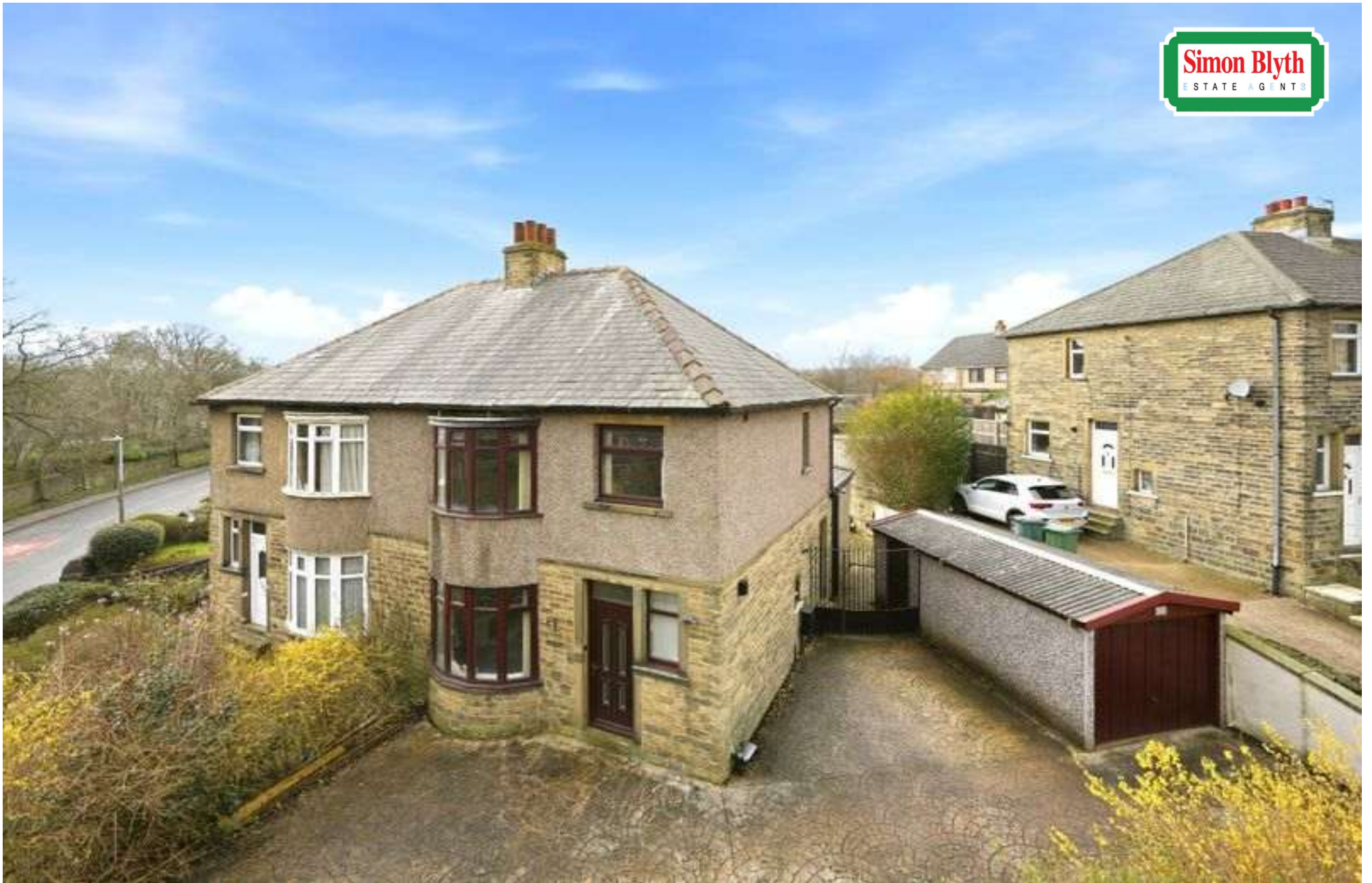
1 Reinwood Avenue, Oakes, Huddersfield, HD3 4DP