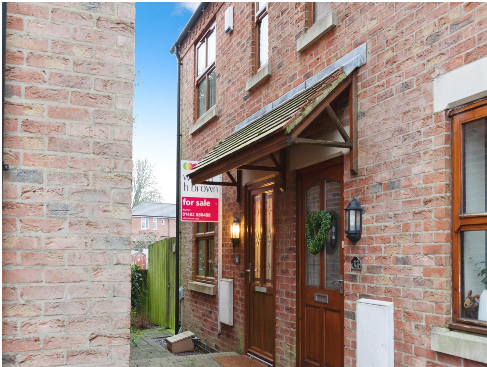
Keldgate Close, Beverley, HU17 8JE