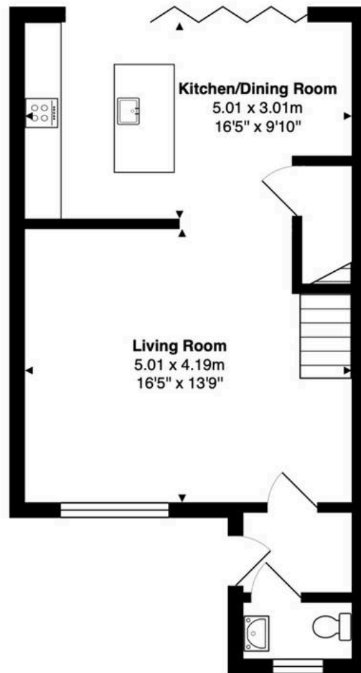
Ground Floor Area: 40.8 m 2 ... 439 ft 2