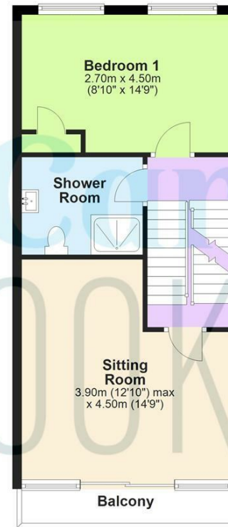
First Floor Approx. 45.2 sq. metres (486.6 sq. feet) (excluding Balcony)