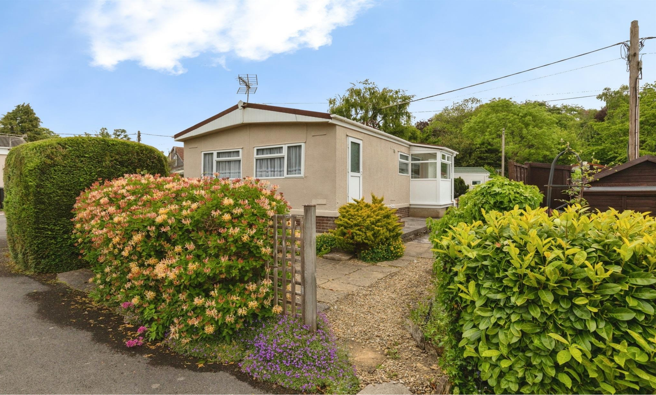
Quarry Rock Gardens, Bath BA2 6EF