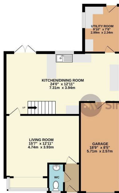
GROUND FLOOR 763 sq.ft. (70.9 sq.m.) approx.