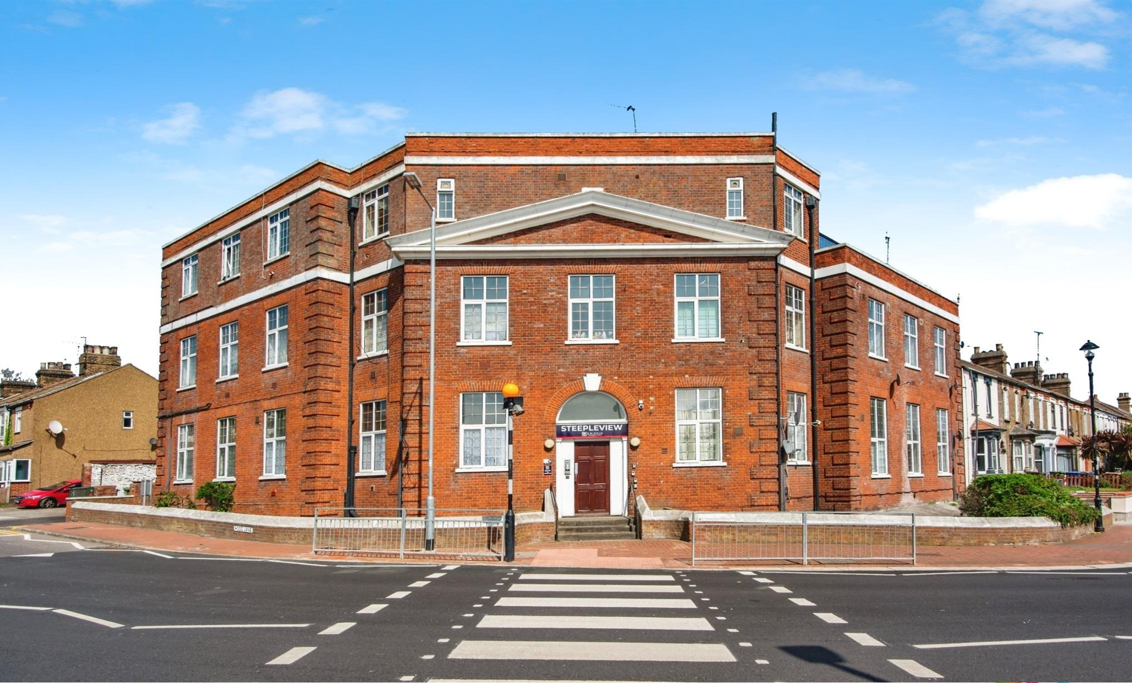
Steeple View, London Road, Grays RM17 5XY