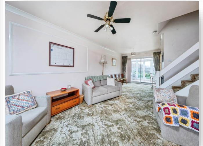
Richmond Way, Newport Pagnell, MK16 0LG