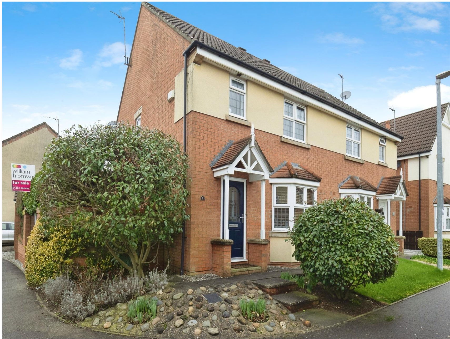
The Bryants, Leven, BEVERLEY, HU17 5QD