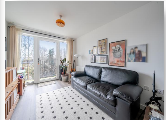
Bowdown House Clivemont Road, Maidenhead SL6 7DF