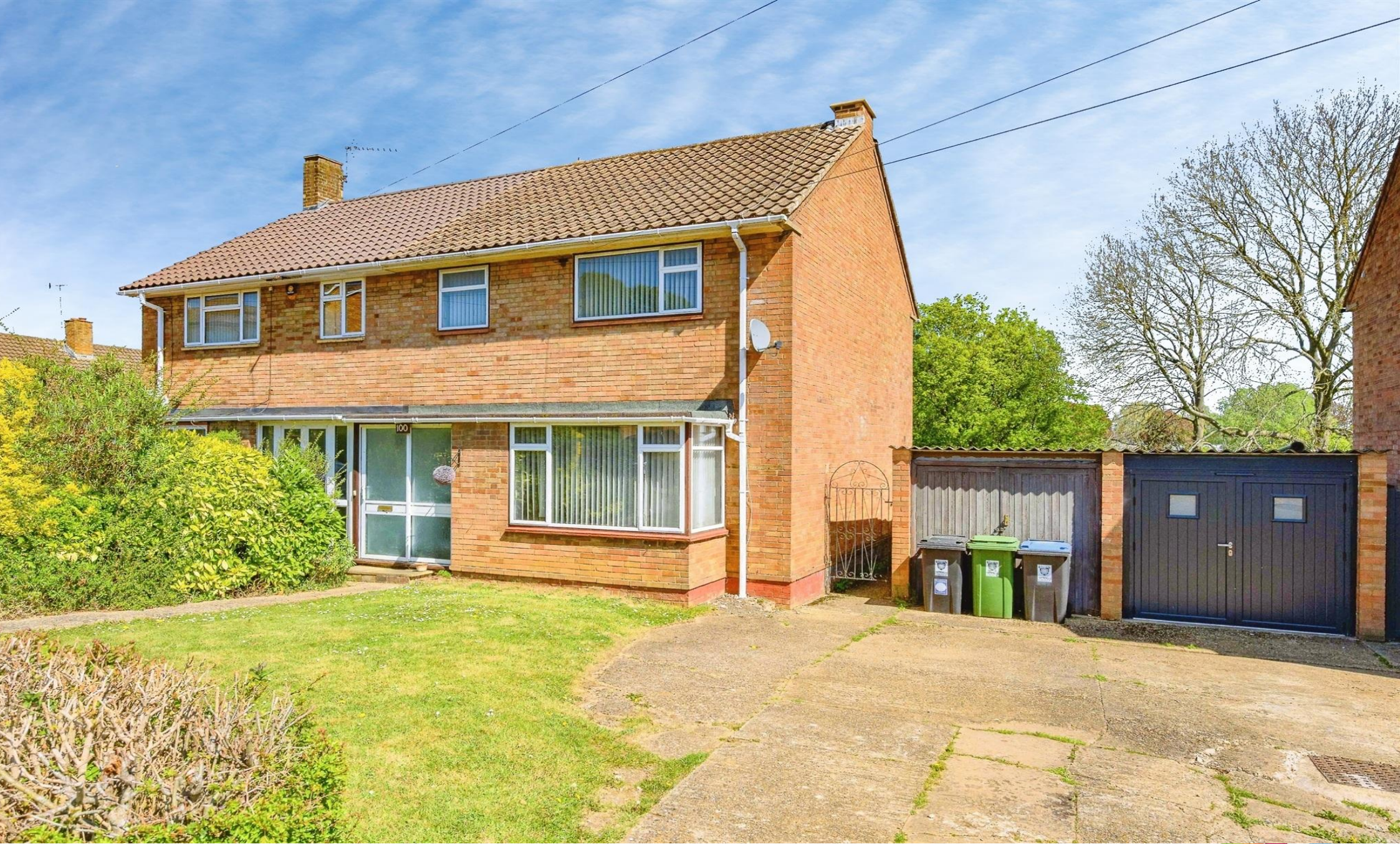
Spring Lane, Hemel Hempstead HP1 3QJ