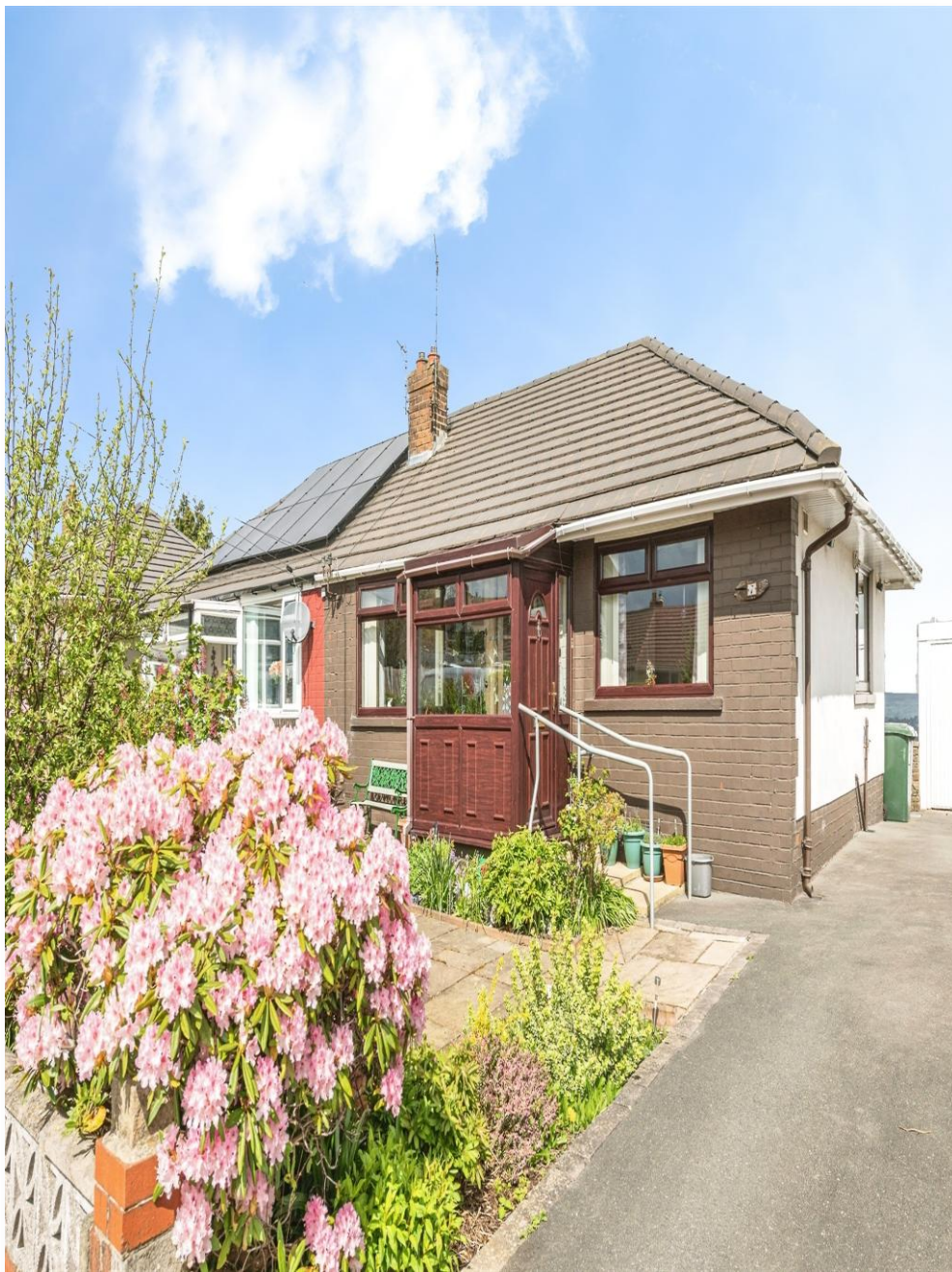
Hebb View, Bradford BD6 3DL