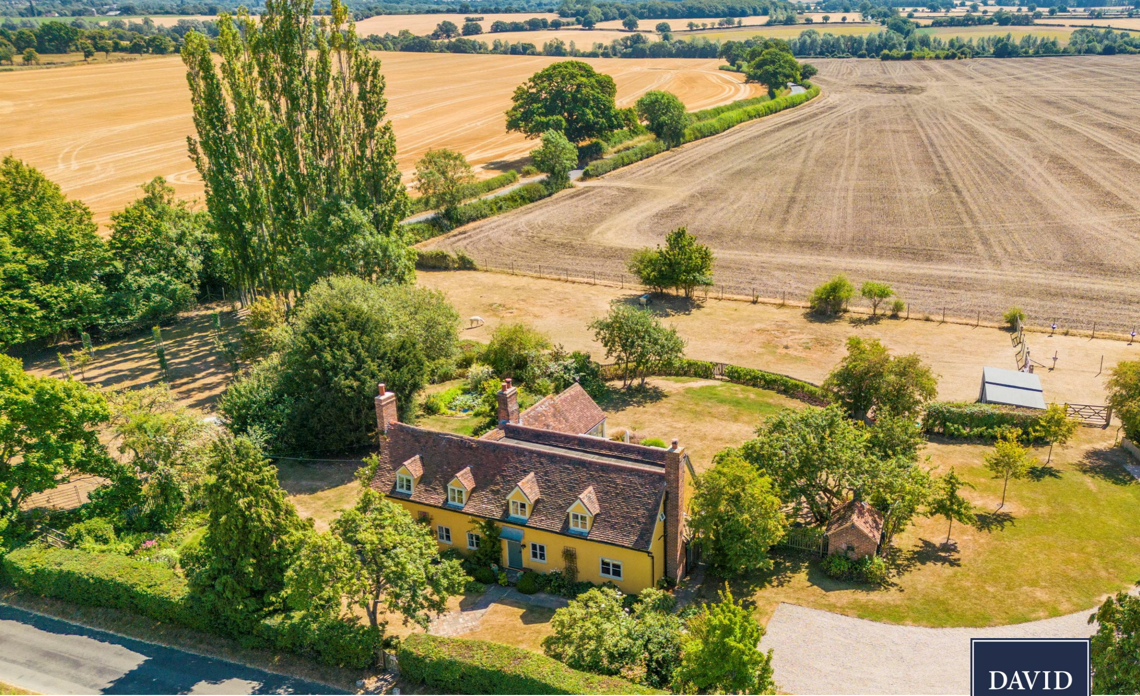
Woodburn Cottage, Borley, Essex