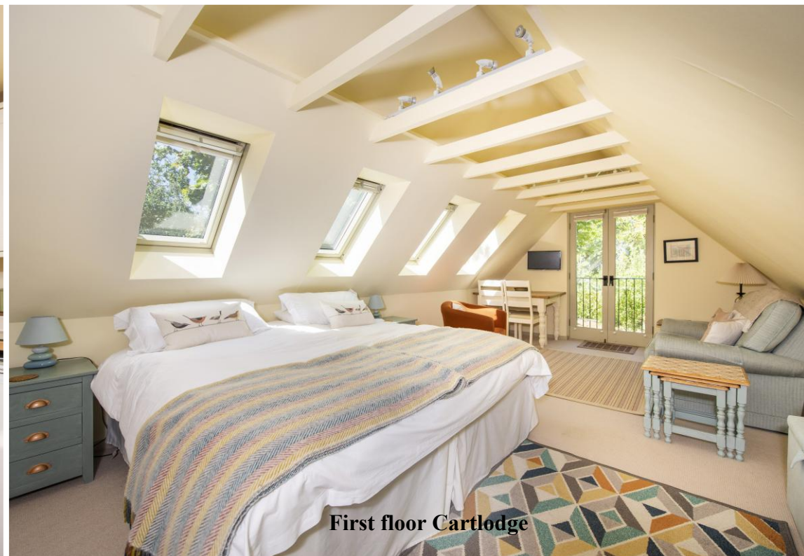
First floor Cartlodge