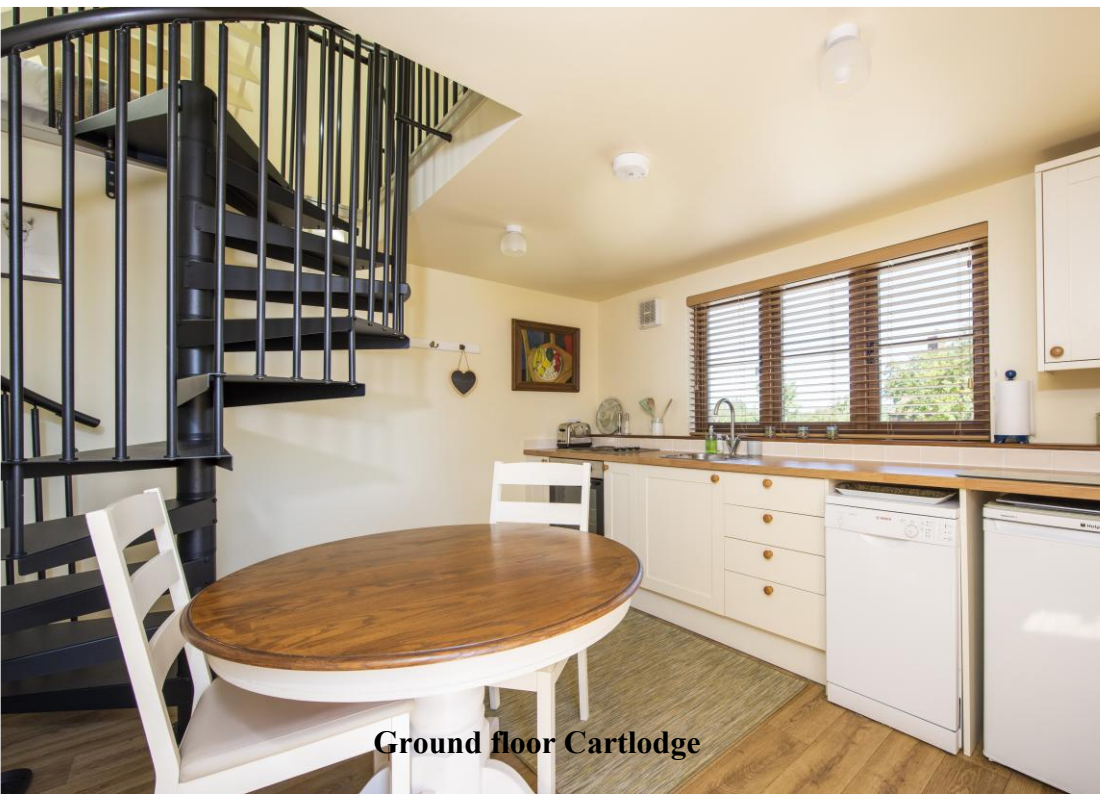
Ground floor Cartlodge