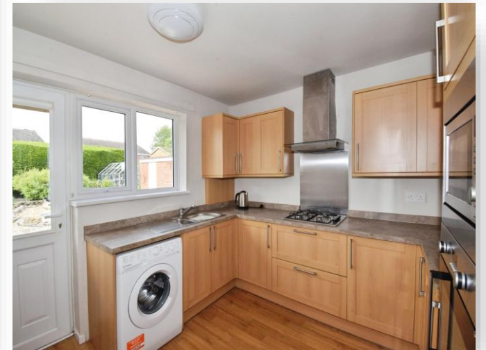
Sywell Drive, Wigston LE18 3XE