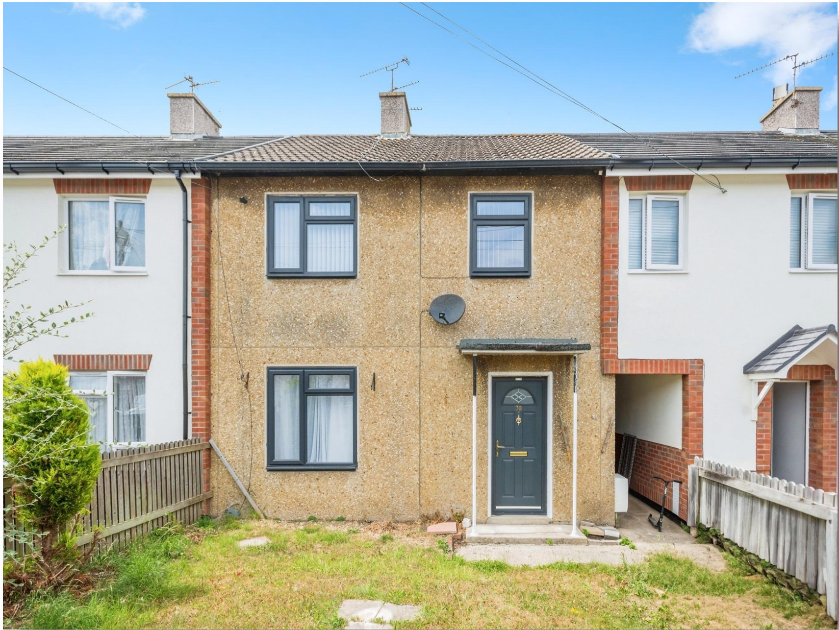
Pinnocks Place, Swindon SN2 7NE