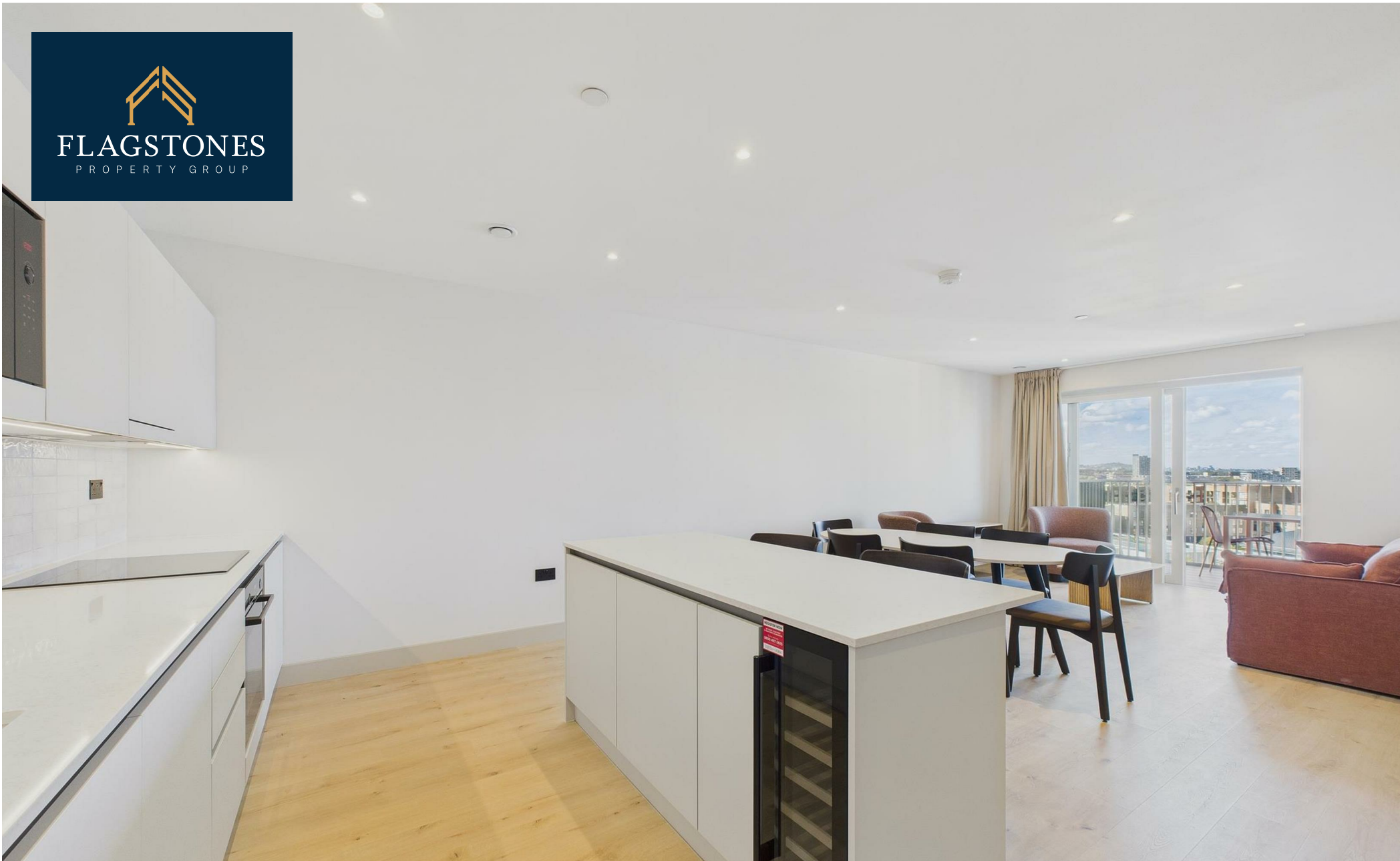
543234543 Caversham Road, Draycote House, Colindale, NW9 5QF £3,350 Per month