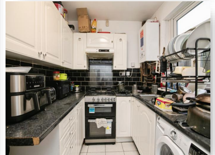
Grasmere Road, Birmingham B21 0UL