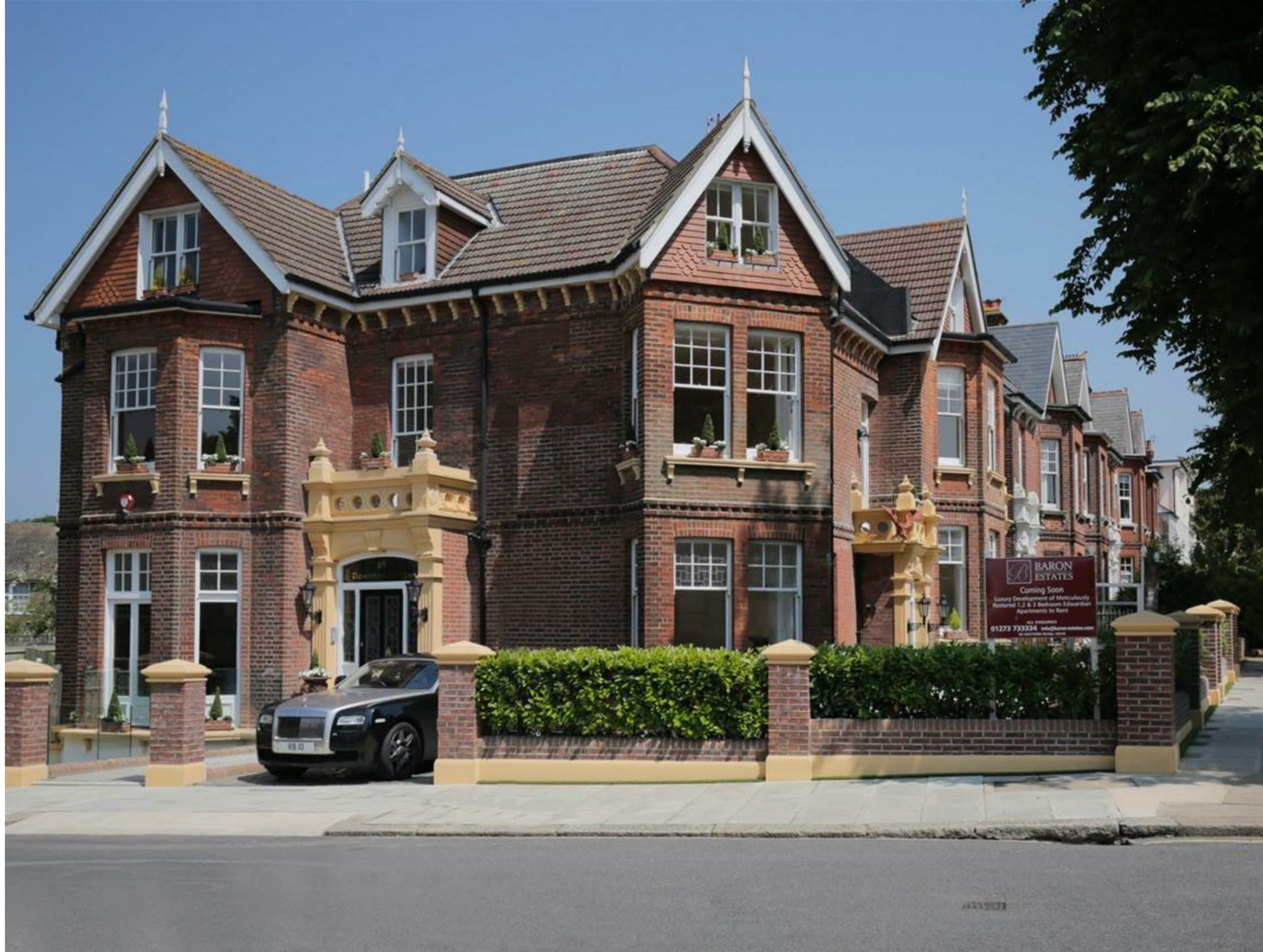
Wilbury Villas, Hove, BN3 6GD £2,300 Per Calendar Month