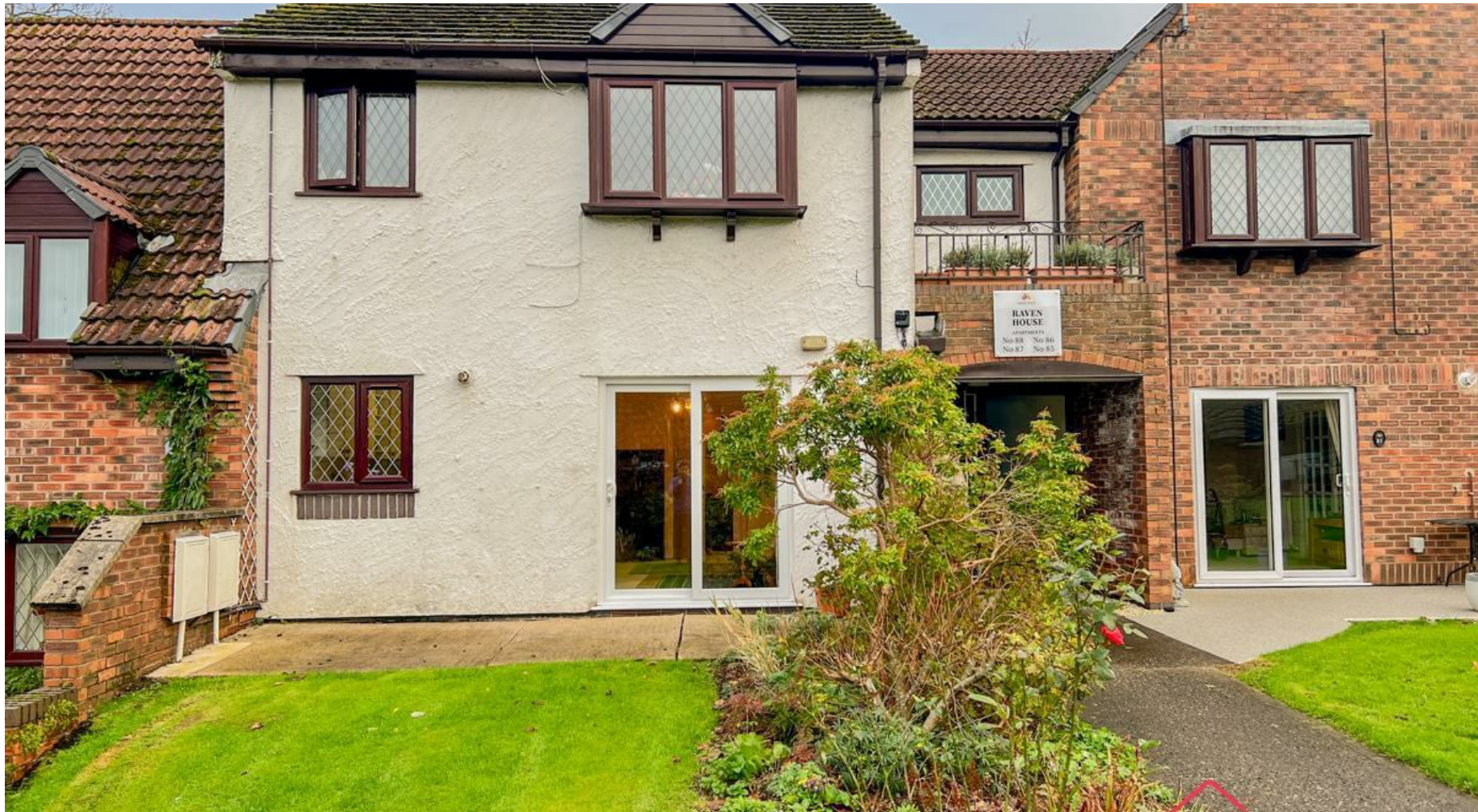
87 Saddle Mews, Douglas, Isle of Man, IM2 1HT Asking Price £190,000