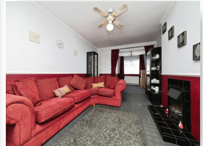
Queens Close, Cottingham HU16 4ER