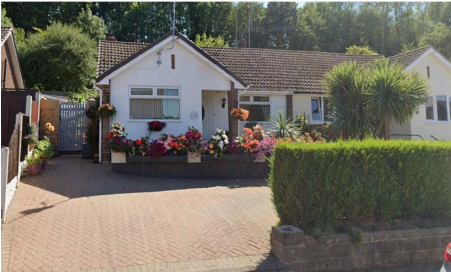
Photo from summer months