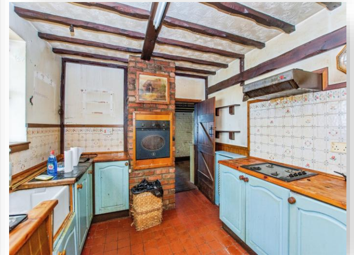
High Road, Elm Wisbech PE14 0AA